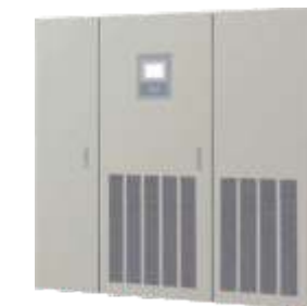
Reliable and Green Energy UPS Systems