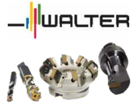
Complete Range of Metal Cutting tools

ProServ is promoted by qualified and experienced Mechanical Engineers with a experience of over 40 years in the field of Manufacturing, Machine Tools and Cutting Tools. Proserv providing Technology Services, Distribution of Machine tools, Cutting tools & its accessories.