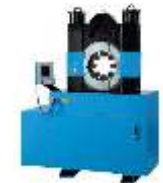
Uniflex Crimping Machines