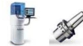
Shrink Fit Tool Holding systems and Balancing Machines