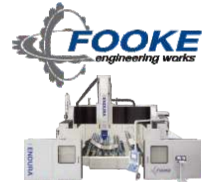
5 axis CNC High Speed compact gantry milling machines